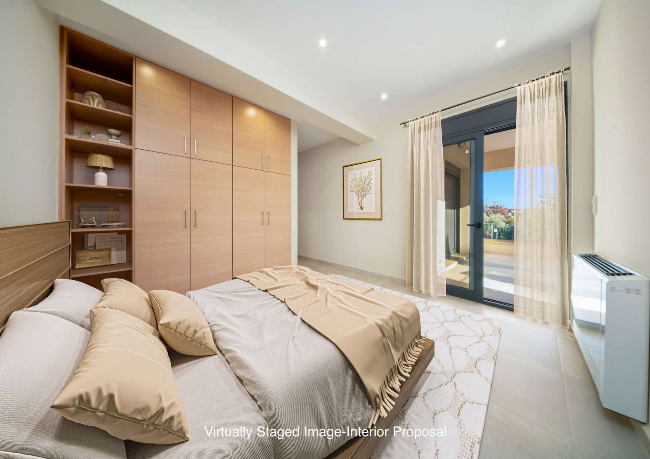
Virtually Staged Image-Interior Proposal