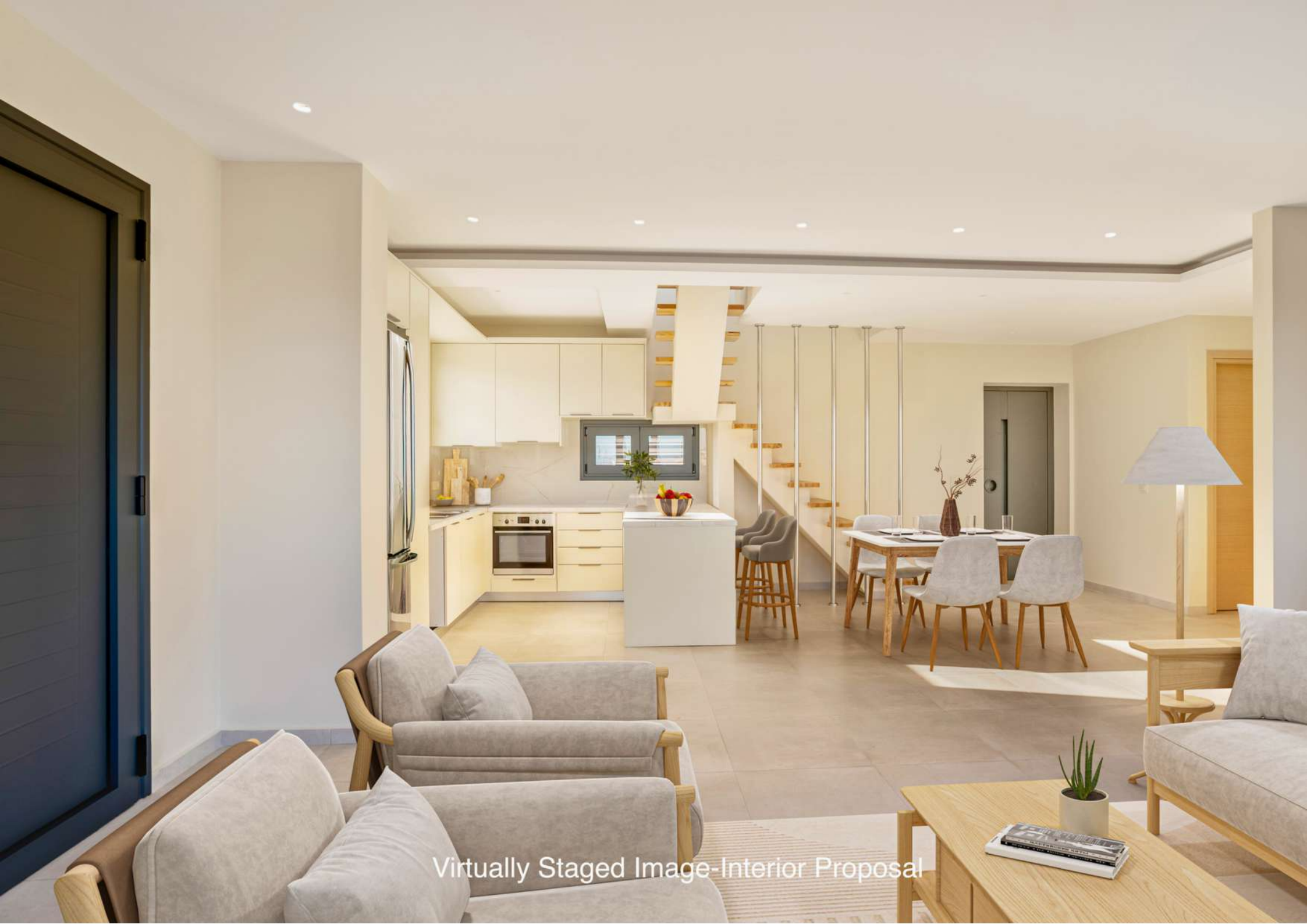
Virtually Staged Image-Interior Proposal